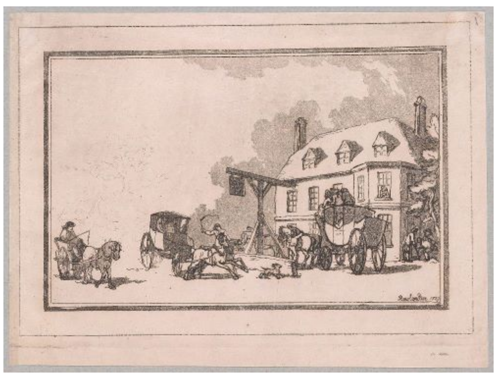
Thomas Rowlandson, '[A posting inn]', Yale University Library Digital Collection, OID 11791520, 1787.

At the centre of his image is a huge inn sign, situated in the middle of the road and towering over the two coaches. Inn signs, which could be attached to a building but could also hang above the street to draw attention to an establishment, belonged to the inn's architecture and provided a visual reference to its name.<sup>6</sup> The print also shows several vehicles, among them a stage coach, on top of which passengers are seated.