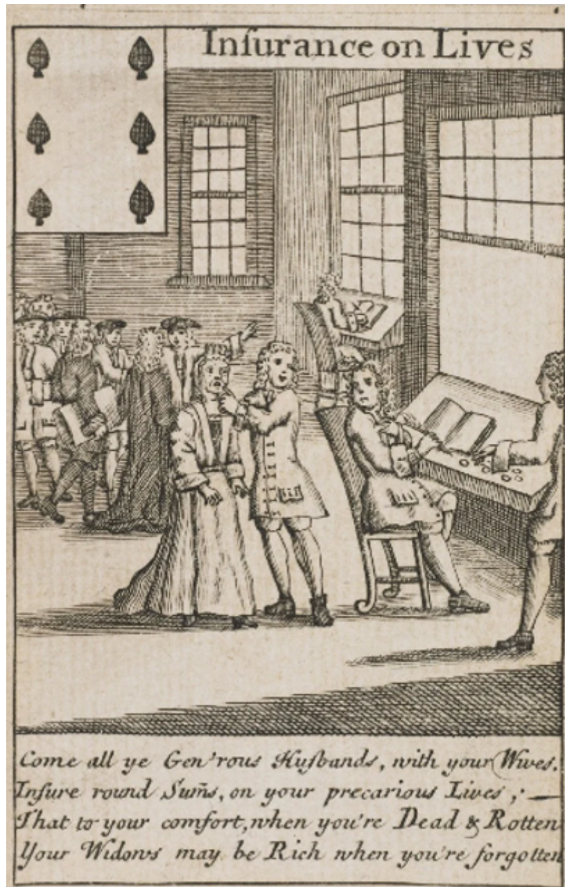
'Insurance on Lives, satirical playing-card, part of a 'Bubble Companies' card deck', 1720

own survival; the Royal Exchange, incorporated in 1720, started to offer life insurance. Lloyd's coffee-house was a place where seafaring captains could share shipping news and negotiate private contracts to cover the risk of shipwreck or violent conflict encountered on their trade routes. Maritime insurance thus expanded and captains were able to insure their own lives along with the safe return of their ships.