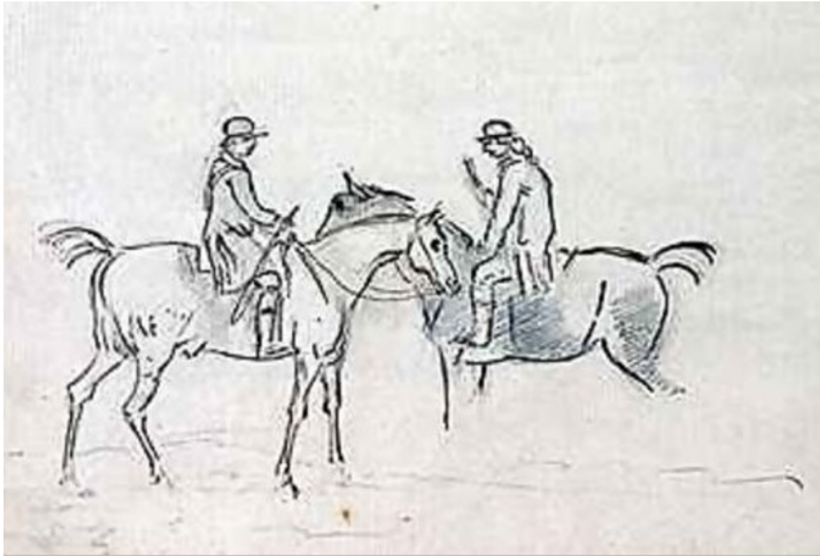
Sawrey Gilpin, 'Two Riders Conversing', Yale Center for British Art, Paul Mellon Collection, undated.

of horses, including scenes showing riders conversing on their horses and imagine many stories involving the characters of the animals living in polite and intelligent company with human beings.