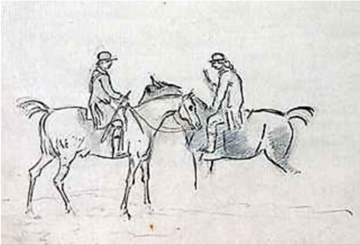
Sawrey Gilpin, 'Two Riders Conversing', Yale Center for British Art, Paul Mellon Collection, undated.

of horses, including scenes showing riders conversing on their horses and imagine many stories involving the characters of the animals living in polite and intelligent company with human beings.