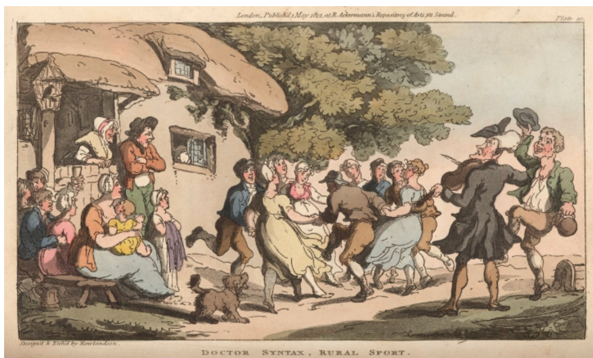
Doctor Syntax, Rural sport (1 May 1812) by Thomas Rowlandson (1757 - 1827) taken from [W. Combe], The Tour of Doctor Syntax in Search of the Picturesque , London 1812, pl.20.

In the Summer holidays (Gilpin, Memoirs , 135), William Gilpin often embarked on tours in search of picturesque beauty in several parts of Great-Britain (South Wales in 1770, Cumberland and Westmoreland in 1772, Hampshire, Sussex and Kent in 1774, High-lands of Scotland in 1776), for which he accounted in his notebooks, which were published in the 1780s and 1790s in several essays of 'observations'. The satirical accounts that were afterwards made of his travels and cartooned by Rowlandson show the clergyman, Dr Syntax, at several social gatherings, putting in at inns, enjoying banquets, watching a military review or attending horse races.