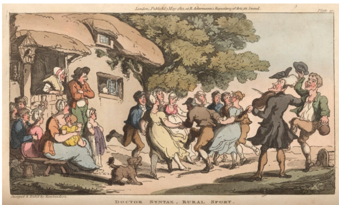
Doctor Syntax, Rural sport (1 May 1812) by Thomas Rowlandson (1757 - 1827) taken from [W. Combe], The Tour of Doctor Syntax in Search of the Picturesque , London 1812, pl.20.

In the Summer holidays (Gilpin, Memoirs , 135), William Gilpin often embarked on tours in search of picturesque beauty in several parts of Great-Britain (South Wales in 1770, Cumberland and Westmoreland in 1772, Hampshire, Sussex and Kent in 1774, High-lands of Scotland in 1776), for which he accounted in his notebooks, which were published in the 1780s and 1790s in several essays of 'observations'. The satirical accounts that were afterwards made of his travels and cartooned by Rowlandson show the clergyman, Dr Syntax, at several social gatherings, putting in at inns, enjoying banquets, watching a military review or attending horse races.