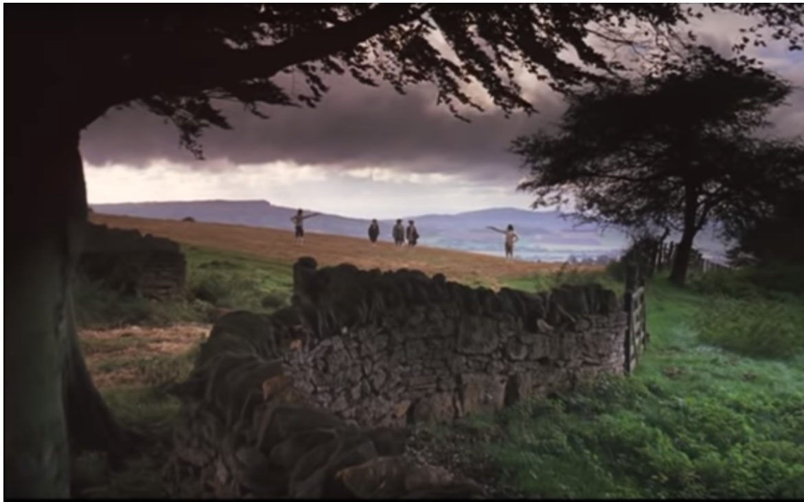
Stanley Kubrick, Barry Lyndon , 1975. Opening scene.

Although Thackeray's Barry Lyndon was written in the nineteenth century, the action is set in the eighteenth century, and the hero, who fights a duel at the beginning of the novel, is forced to flee, thinking (wrongly) that he has killed his opponent. Stanley Kubrick's adaptation opens on a duel in which the hero's father is killed and ends on a duel between Barry and his stepson.