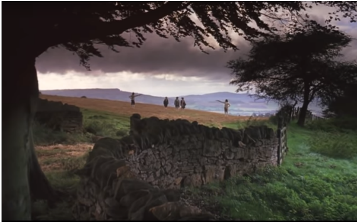
Stanley Kubrick, Barry Lyndon , 1975. Opening scene.

Although Thackeray's Barry Lyndon was written in the nineteenth century, the action is set in the eighteenth century, and the hero, who fights a duel at the beginning of the novel, is forced to flee, thinking (wrongly) that he has killed his opponent. Stanley Kubrick's adaptation opens on a duel in which the hero's father is killed and ends on a duel between Barry and his stepson.