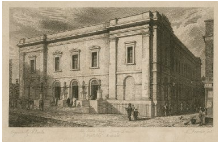
S. Rawle, 'New Theatre Royal Drury Lane, B. Wyatt Esqr., architect [graphic] / engraved by S. Rawle ; L. Francis delt', Folger Shakespeare Library , 30373, late 18th to mid-19th century,

The last theatre on the site, designed by Benjamin Wyatt, opened in 1812; most recently refurbished in 2021, it remains a working theatre today. 2